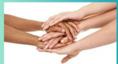
Family Inside Out

VENUE Moor Nook Family Hub Burholme Road Preston PR2 6HN