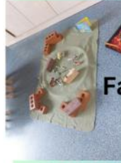
Family Messy Play