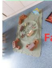
Family Messy Play